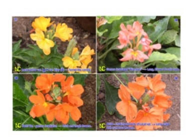
Irradiation induced flowers