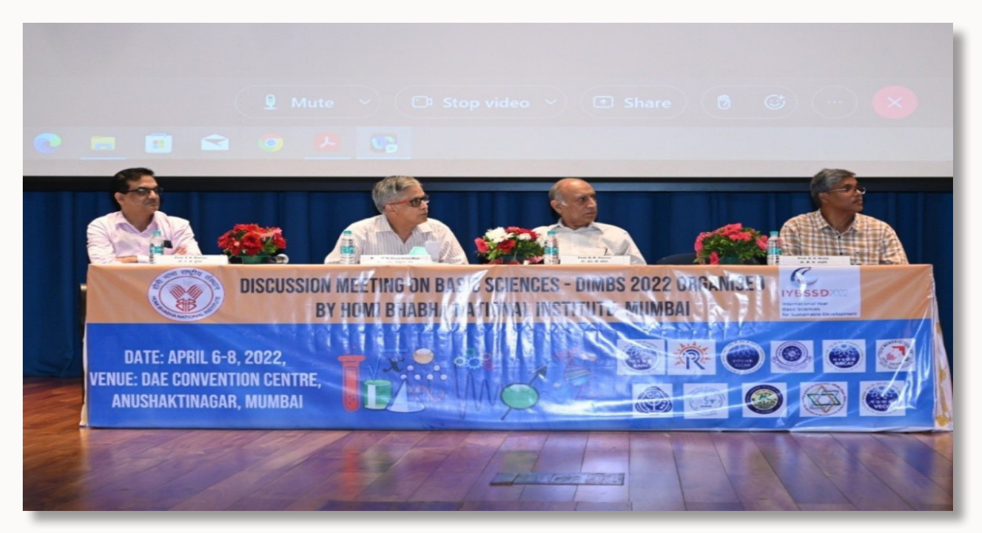
Dignitaries on the dais during the valedictory session of DiMBS-2022

DISCUSSION MEETING ON BASIC SCIENCES - DIMBS 2022