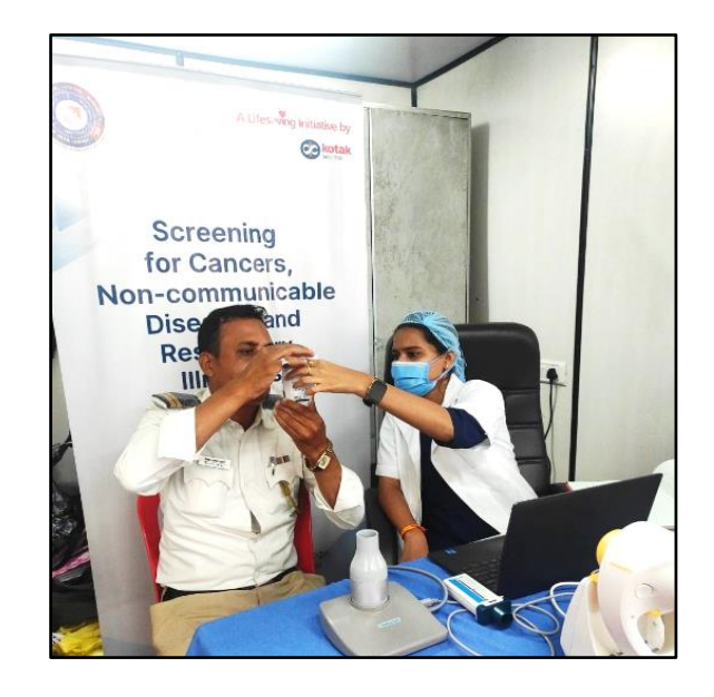
Performing Breath CO