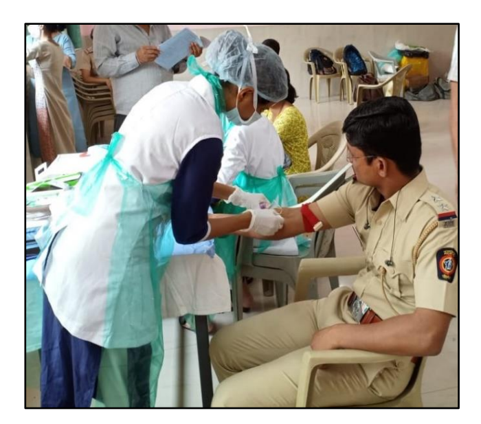
Blood Collection by Health Assistant