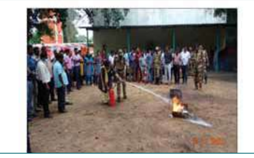
Fig. 2: Fire Safety Training by CISF Fire Wing

Live demonstration of various types of fire extinguishers used to put off the different type of fire scenarios were conducted with the co-ordination of NPCIL Fire officers & CISF Fire Wing during the IFST programme.