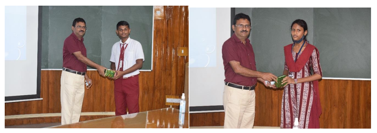
(Caption : Some winner receiving Prizes during Quiz program)