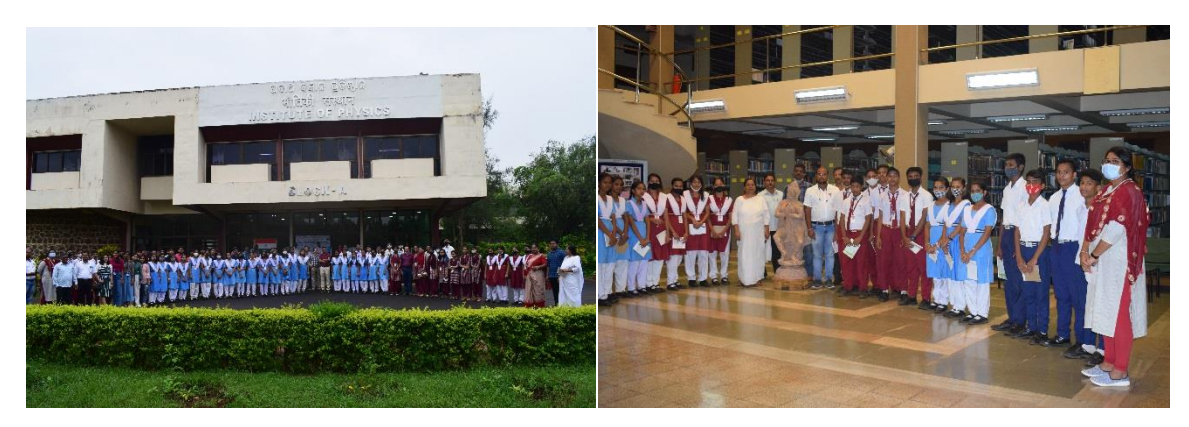
(Caption: Group Photo of participants)