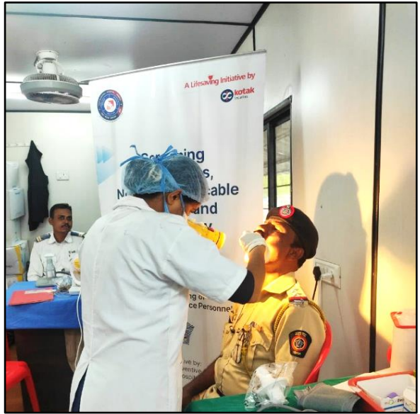
Oral Cavity Examination by Health Assistant