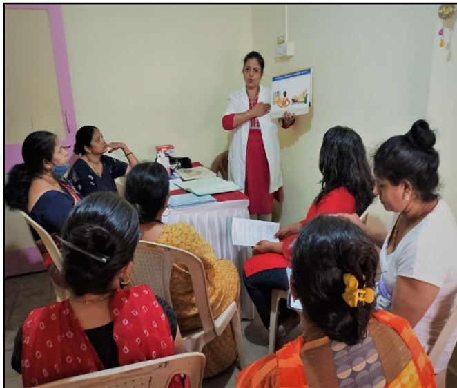
Health Education by MSW