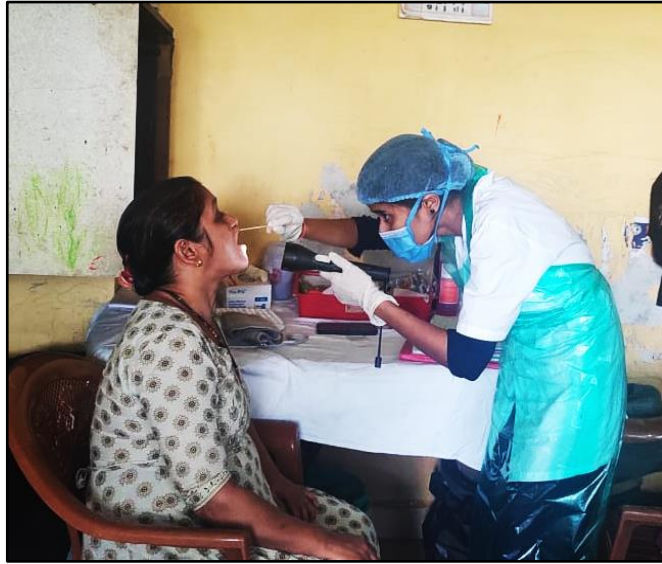
Oral Cavity Examination by Health Assistant