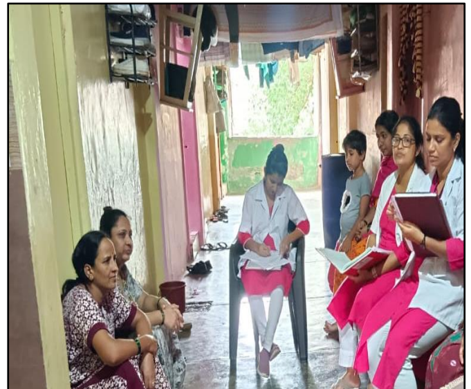
Registration and obtaining Informed consent