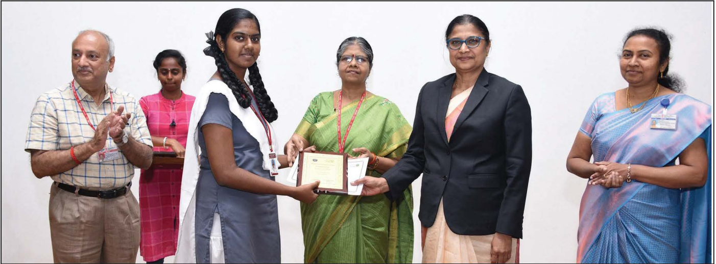
Felicitation to school children

Women's Day was celebrated from March 1- 7, 2023, at IGCAR. The celebrations included competitions and felicitating girl students who have excelled in studies, sports and cultural events. Distinguished women in law and justice, news broadcasting and financial advice were invited to share their experiences and educate the audience.