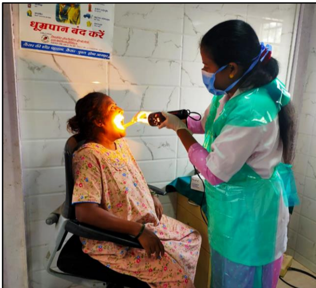
Oral Cavity Examination by Health Assistant