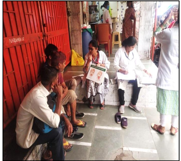
Health Education by MSW