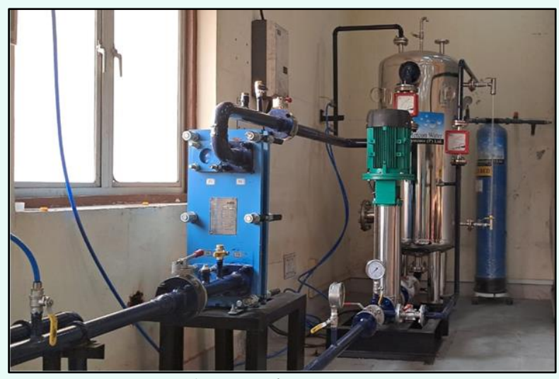
Figure 1: Low Conductivity Water system