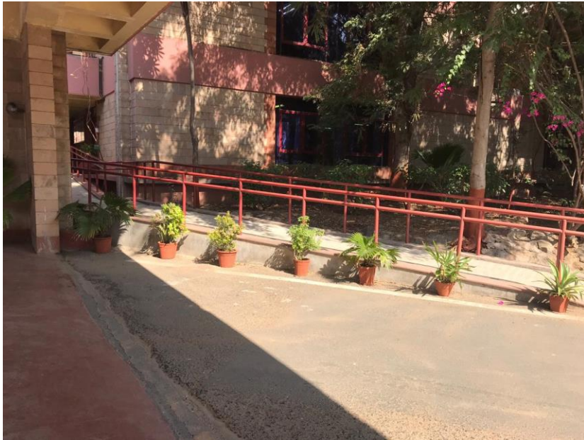
Ramps for easy access to classrooms-IPR-Gandhi Nagar