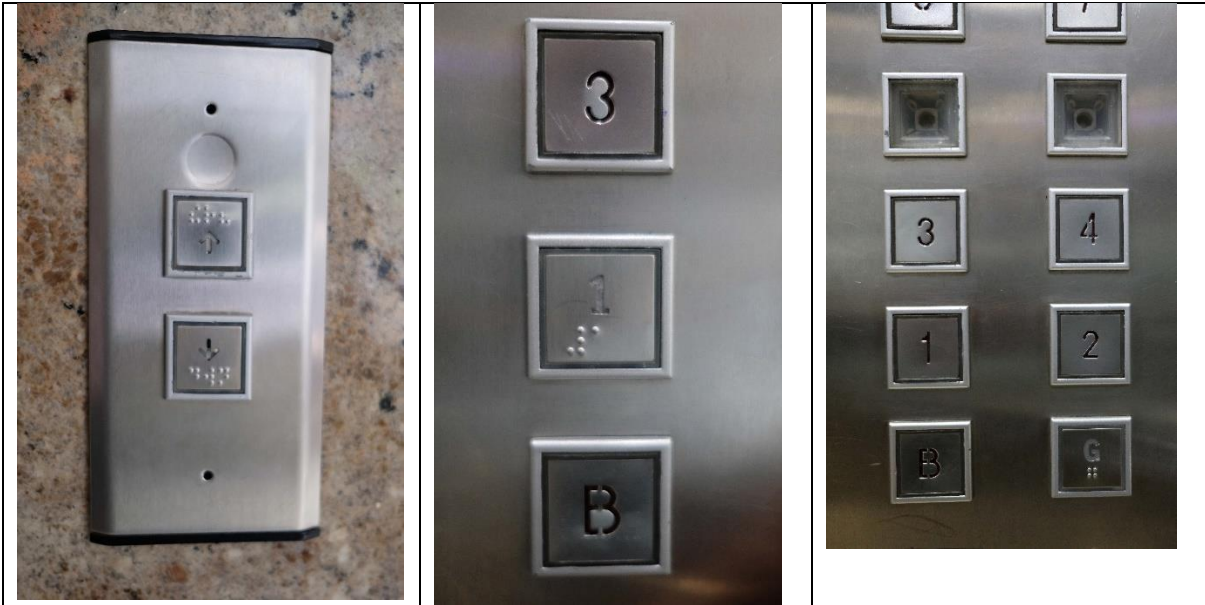
Disabled Friendly Lift Facility at Tata Memorial Centre, Mumbai