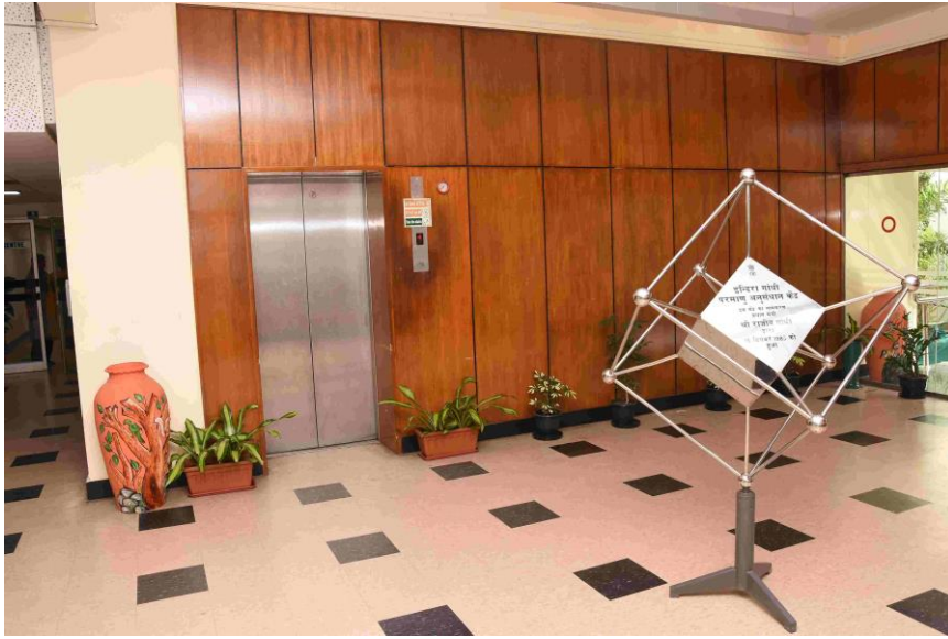
IGCAR-Disabled Friendly Lift