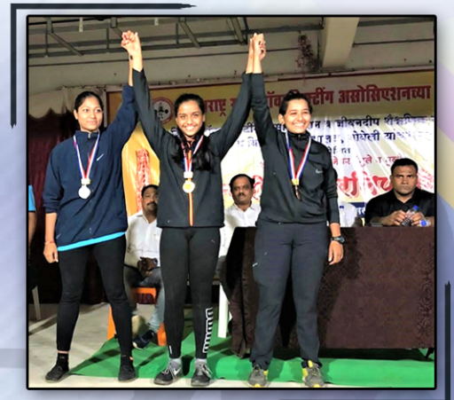
Senior State Powerlifting Championship 2021-2022; December 2021- Kolhapur