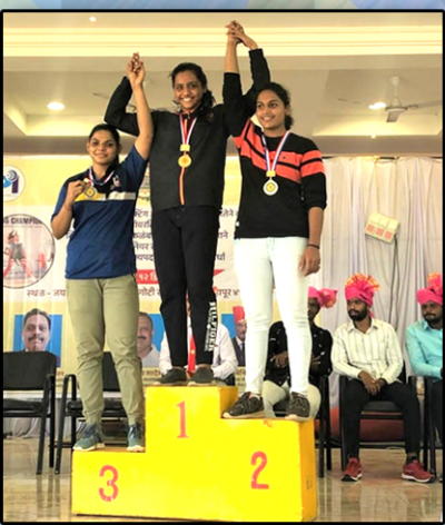
Junior State Powerlifting Championship 2021-2022; October 2021; Goveli, Kalyan